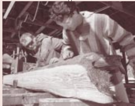
ABOVE: The Goodwin sawyers study a river-recovered log to isolate the defects and render the highest quality timber.

Much of the finest cypress grew where the land was submerged most of the year. Trees were marked and girdled a year in advance of logging to allow the wood to lose part of its moisture, so that when cut,