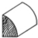
QUARTER ROUND 3/4” x 3/4”